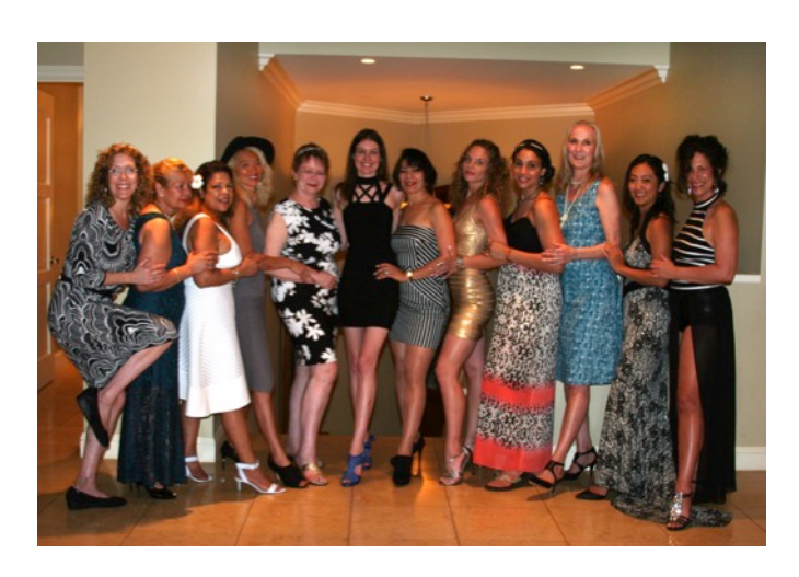
Feminine Community - Maui

You can rest assured that we want the same for you. Let us know what you aim to do, and we will provide the map and the skills to live your dream.