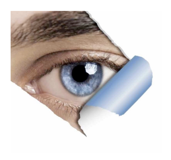
Communication (Sept. 06.-11. Ibiza)

If you are ready to see beyond the ordinary, contact us today to enroll in The Art of Seeing .