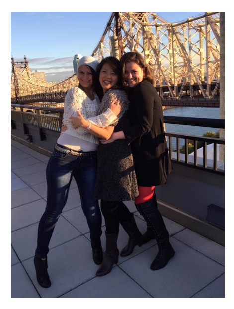
Self-Actualization (Ibiza, January 02-08)

We all live two lives. One consists of the important roles we play—mother, father, brother, friend, and career professional. The other is that deep, serene presence that has traveled with our species from the dawn of time.