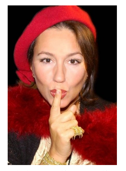
What happens on Ibiza, stays on Ibiza

I am not aware of another business system in which the participants focus on empowering and assisting each other to such a degree. We are fortunate to have created a cooperative system based on generosity and loving-kindness. All of our clients, students, and professors are in service. We play for the love of the game and for the happiness we enjoy when we give our time and expertise to each other. When the goal of business is profound harmony, anything becomes possible.