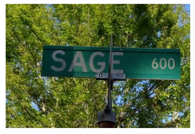
Sage Road in Houston, TX

If you know somebody that is interested in being involved, please email info@sageuniversity.com.