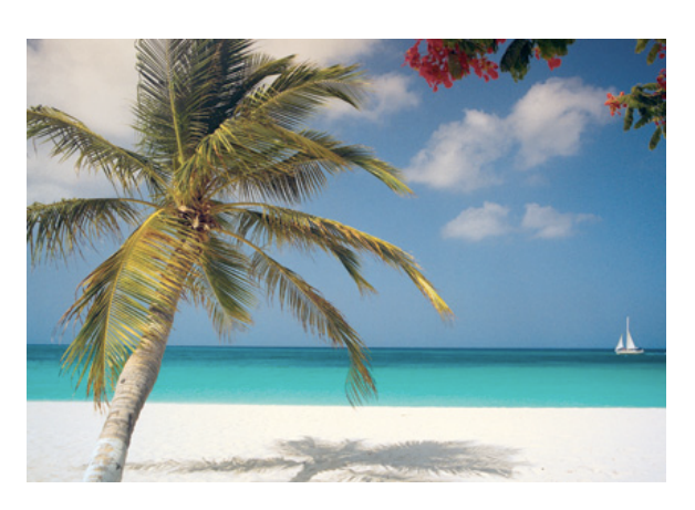
Palm Beach, Aruba

Entrepreneurship is the business of providing value to other people. As a small business owner you must win clients through the quality of your mood and attitude. Travel alone isn't enough to shift your mood and transform your life. That is why we put travel, recreation, adventure and learning all together in a package that will open your heart and mind to a new dimension of living.