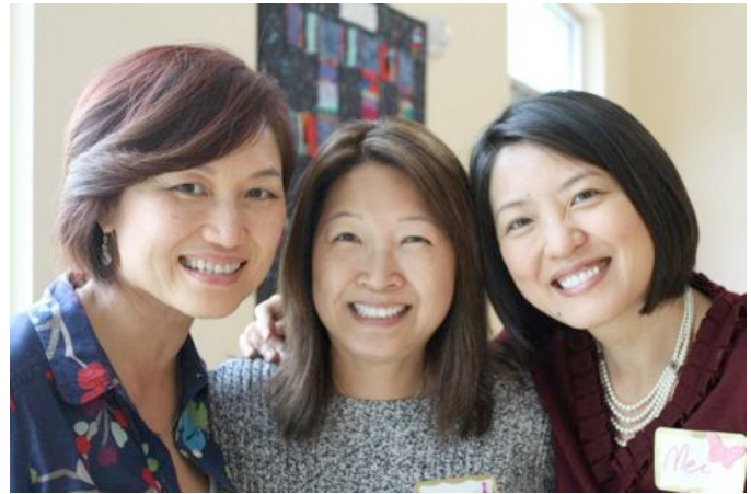
All for one—one for all