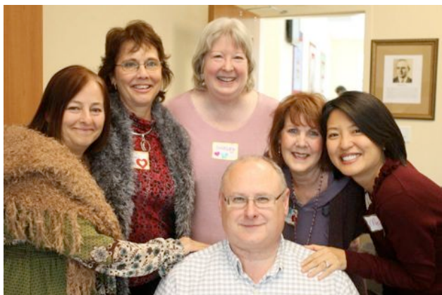
Austin: You have to feel it!